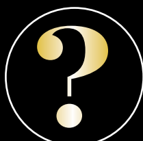
EDIDA DESIGNER OF THE YEAR 2017 IT COULD BE YOU!