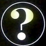
STUDENT OF THE YEAR 2017 IT COULD BE YOU!